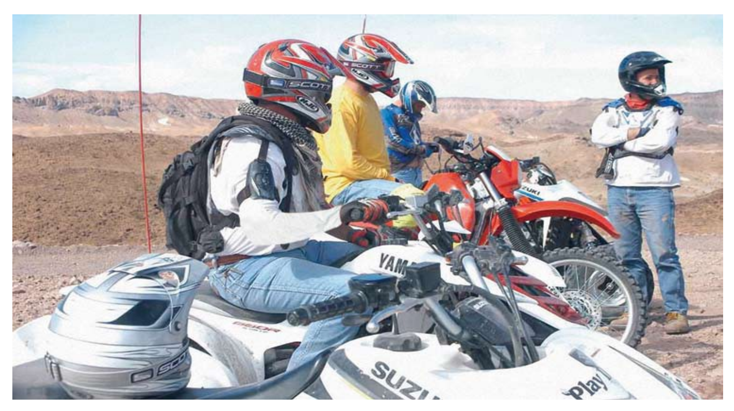
Marines stop and take in the scenery at Senator's Wash, 25 miles north of Yuma. The stops also allowed them to check for any vehicle damage and ensure every Marine was uninjured and accounted for.

the doctor arrived he gave me four shots in the wound to extract the stick. Once it was out, the blood would not stop flowing. I was extremely glad at that point that I was at the hospital and had decided not to pull the stick out myself. After leaving the hospital, I went back to my friend's house for the night to rest up, and the next day, returned to San Diego. I reported into my command where they decided I was to be sent to Non-judicial Punishment. I was charged with twice violating article 92 of the Uniform Code of Military Justice: once for disobeying my Commanding Officer for not wearing a helmet, and the second for disobeying my Master Sergeant. My punishment was reduction in rank to PFC. one-half months pay for one month, and 45 days restriction/ 45 days extra duty; all which were suspended, for six months except for the half-months pay, $846.00. The CO also banned me from driving any motorized vehicle that I did not have a license for, which boils down to anything except a car or truck.